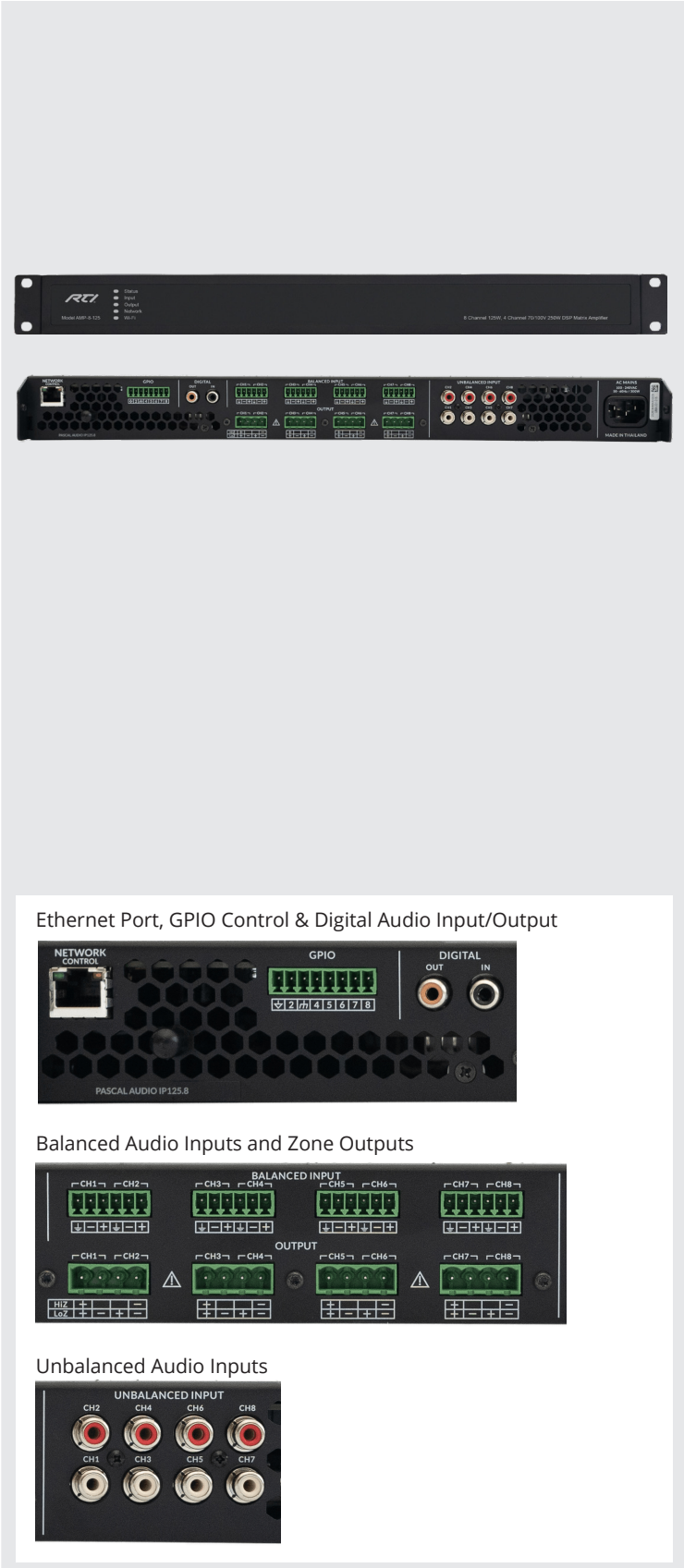
Ethernet Port, GPIO Control & Digital Audio Input/Output

AMP-8-125, power cord, 6-pin Phoenix input connectors (4), 4-pin Phoenix output connectors (4), 8-pin Phoenix GPIO socket connector (1), rack-mount kit (1), adhesive rubber feet (4)