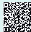
Humly Room Display

Humly Room Display is the perfect interactive display for your collaboration spaces. It will help you to find the space you already booked, or guide you to one that is available right now.