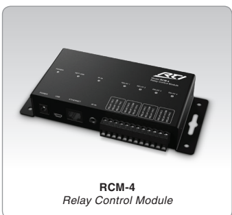
RCM-4 Relay Control Module