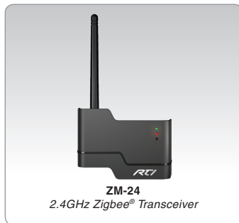
ZM-24 2.4GHz Zigbee® Transceiver