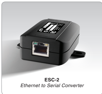
ESC-2 Ethernet to Serial Converter