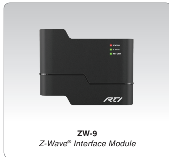
ZW-9 Z-Wave® Interface Module