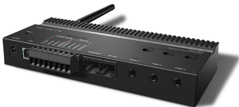
XP-3 Control Processor

*NOTE: Using a 433MHz RTI remote control with the XP-3 requires a separate RM-433 Antenna. Also, while this configuration is possible, its use should be limited to secondary zones that aren't heavily used (guest rooms, outdoor areas etc). Installations requiring primary control via both Zigbee and 433MHz controllers should use an XP-6 or XP-8s control processor.