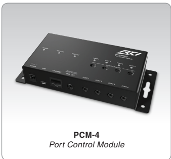
PCM-4 Port Control Module