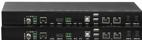
VXP-R and VXP-T HDBaseT Extenders (Sold Separately)