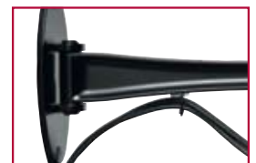
Cable management from the display to the wall plate for an organized, clean look