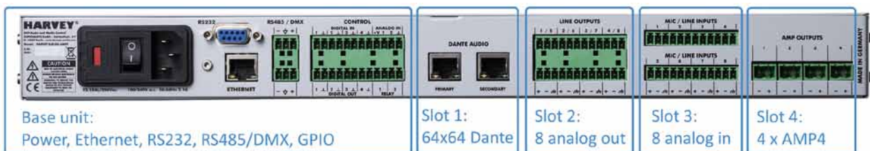
Example device: HARVEY Pro 8×8-DA-AMP4